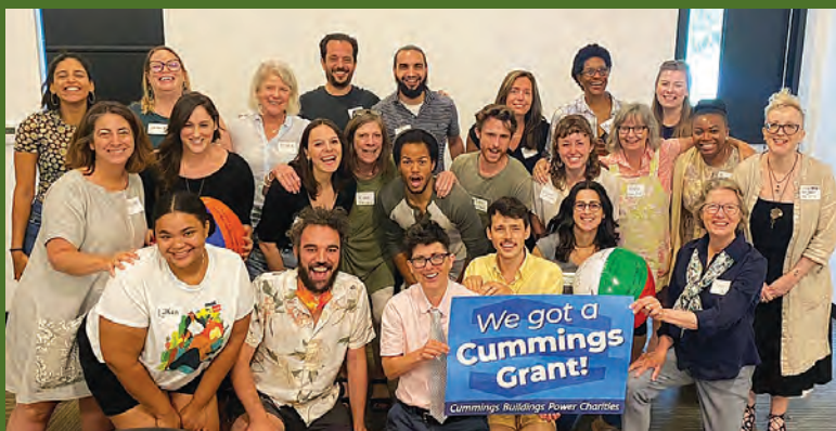
Our talented team at Rehearsal for Life. We love what we do!