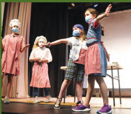
Newton Troupe's original musical "The Rash at Ohio State".