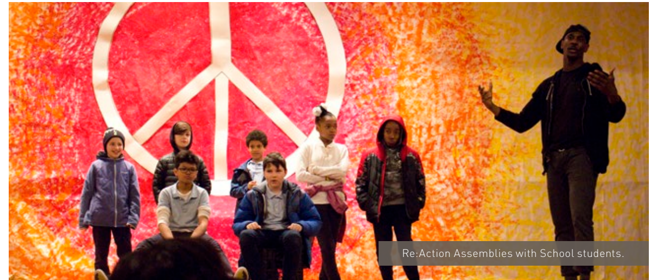
Re:Action Assemblies with School students.