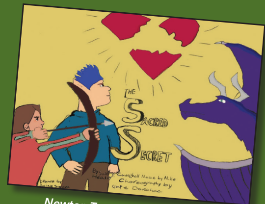
Newton Troupe Digital Playbill

Thank you for all the fun and fantastic days, that all of you have provided for us I am going to miss seeing the videos and talking about them